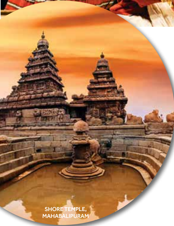
SHORE TEMPLE, MAHABALIPURAM